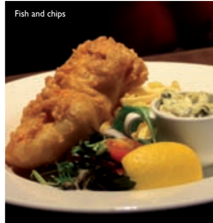
Fish and chips