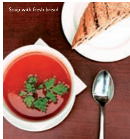
Soup with fresh bread

Our food is freshly made on site by our own team of Chefs. It contains no additives or flavourings, only natural ingredients.